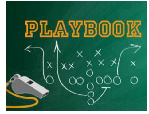
Saturday 8/29/2020 8:00 AM - 1:00 PM

Does your playbook incorporate proven principles, strategies and "plays" that will lead to seeing people saved, baptized and set on the road to discipleship? Discover how to develop a winning game plan for your group and discipleship ministries.